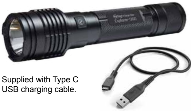
Supplied with Type C USB charging cable.