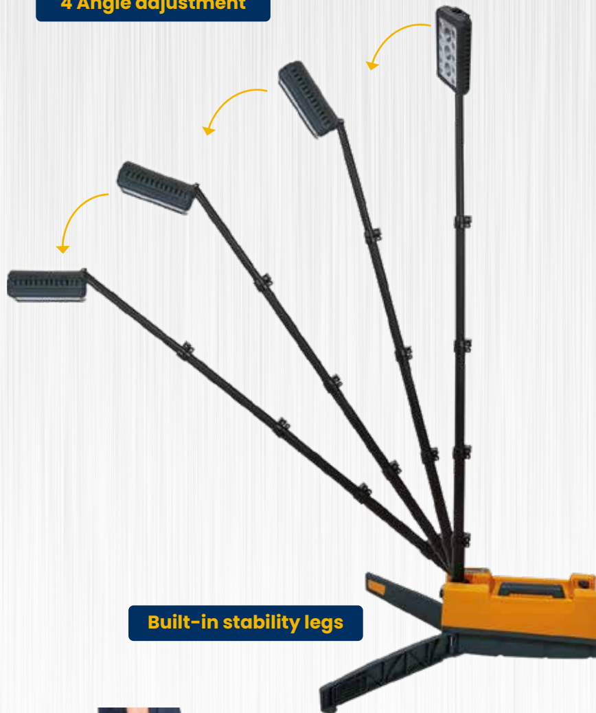
Built-in stability legs