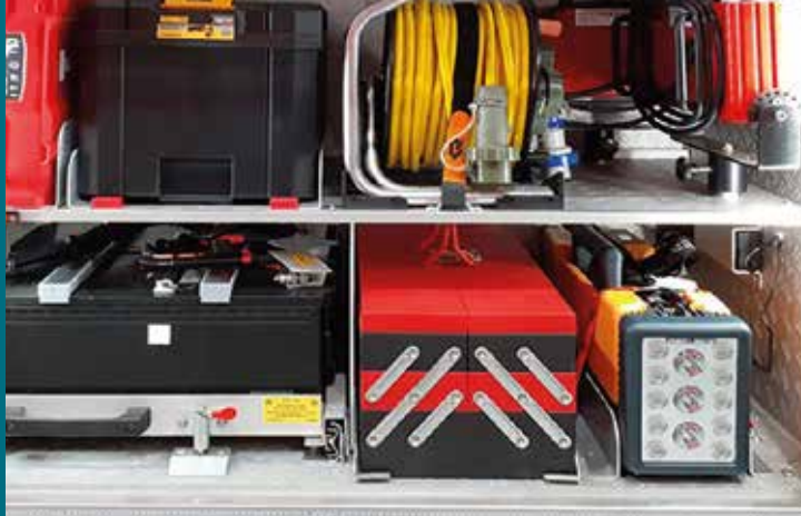
FOLDS DOWN TO COMPACT SIZE