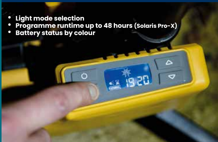
LCD FULLY PROGRAMMABLE DISPLAY