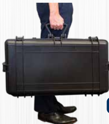
Optional carry case