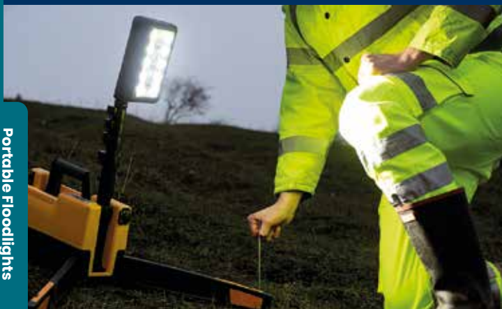
OPTIONAL STABILITY PEGS